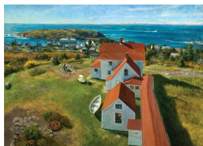
ALEXANDRA TYNG (b. 1954) LIGHTHOUSE DAY 2010, OIL ON LINEN, 34 x 48 IN. DOWLING WALSH GALLERY, ROCKLAND, MAINE

Information: 357 Main Street, Rockland, ME 04841, 207.596.0084, dowlingwalsh.com