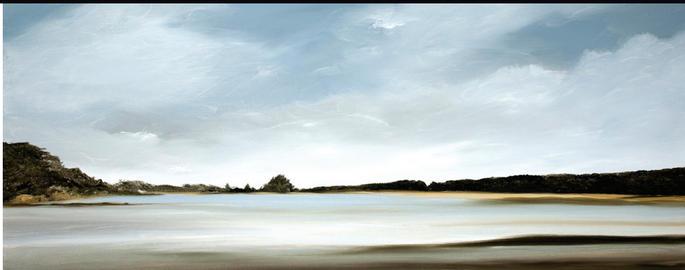
RICK FLEURY (b. 1960) FREEDOM 2011, OIL ON CANVAS, 16 x 40 IN. ADDISON ART GALLERY, ORLEANS, MASSACHUSETTS

Information: 43 Route 28, Orleans, MA 02653, 508.255.6200, addisonart.com