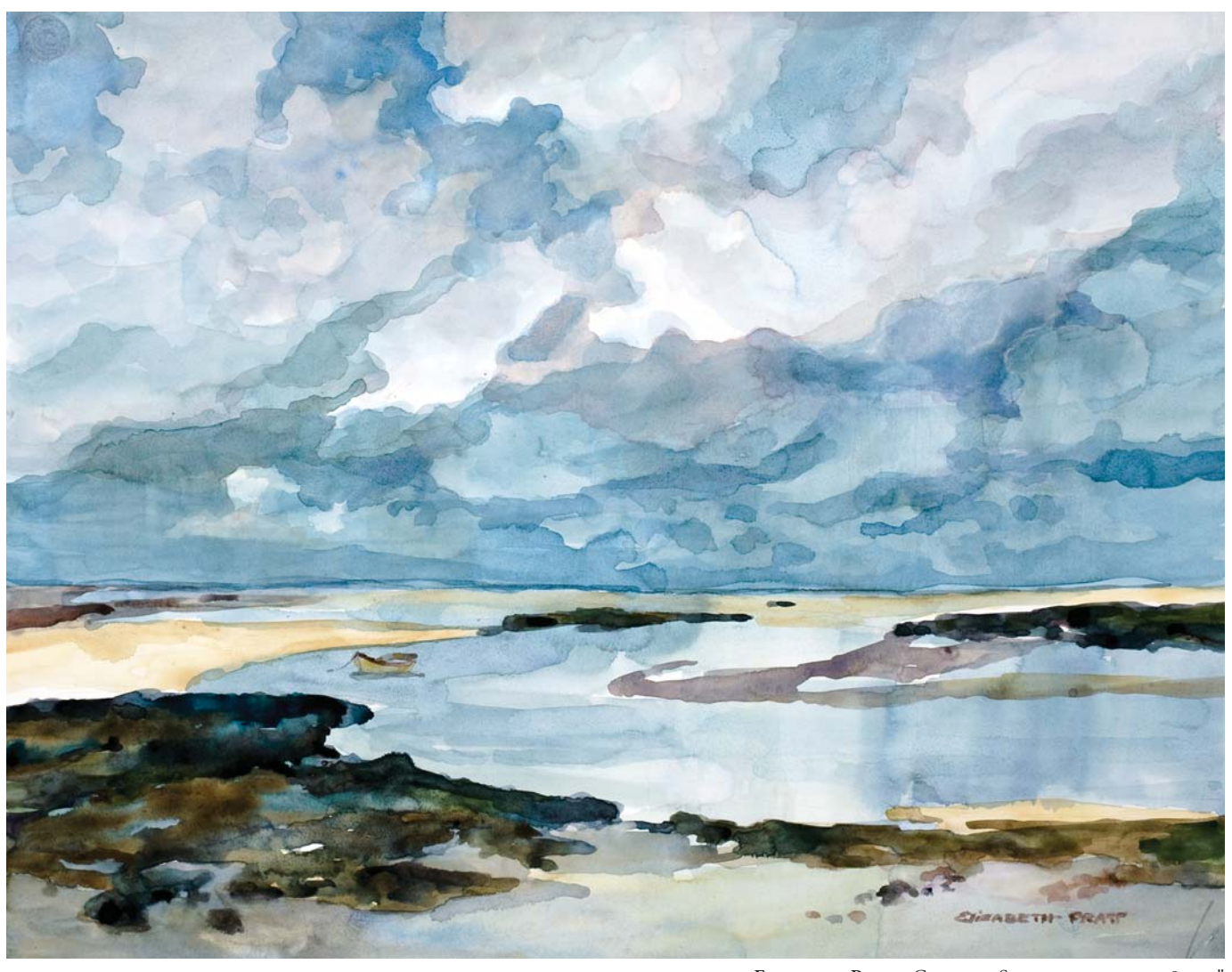
Elizabeth Pratt, Clearing Skies, watercolor, 18 x 23 ^{\circ}