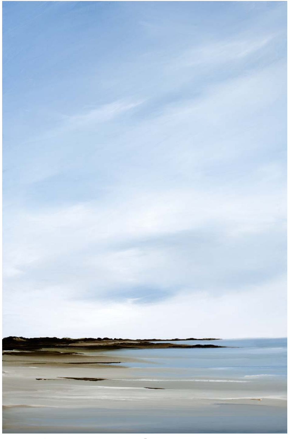
RICK FLEURY, ASPECT, OIL ON CANVAS, 36 X 24 X 11/2"

"The colors in Clearing Skies evoked a feeling of light just after a rain shower," says Pratt. " Ocean Surge captures the force the Atlantic can show when it is whipped up by the wind. The swells are painted without preplanning, just quick rhythmic brushwork."